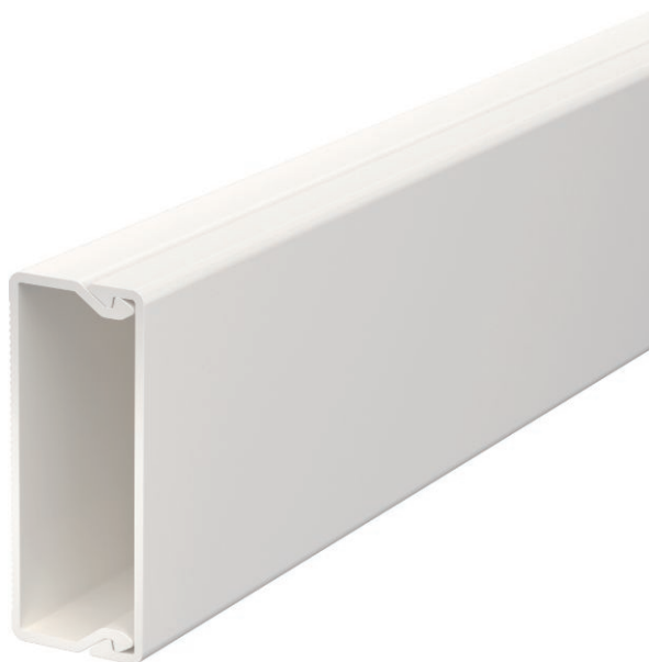
Trunking cover and base with base perforation.